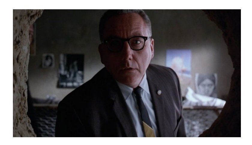
115 - The Warden, furious Andy has disappeared without a trace, throws Andy's chess pieces at the Raquel Welch poster and discovers a gigantic hole in the wall. Andy has tunneled out and escaped from Shawshank.